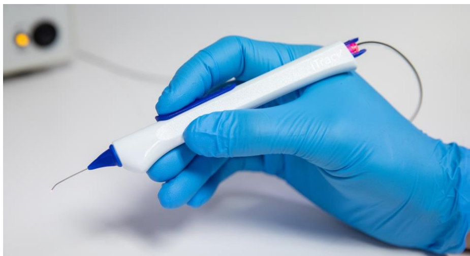
Figure 2: iTrack™ Advance canaloplasty device